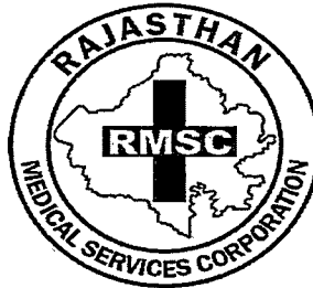
SPECIMEN LABEL FOR OUTER CARTON

Surgical to be supplied with the following logogram and with the word " Rajasthan Govt. Supply- Not for sale निःशुल्क वितरण हेतु QC – Passed " overprinted and the following logogram in which will distinguish from the normal trade packing. Name of surgical should be printed in English and Hindi languages and should be legible and be printed more prominently. Storage directions should be clear, legible, preferably with yellow highlighted background.